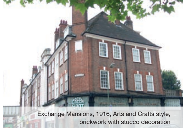
Exchange Mansions, 1916, Arts and Crafts style, brickwork with stucco decoration