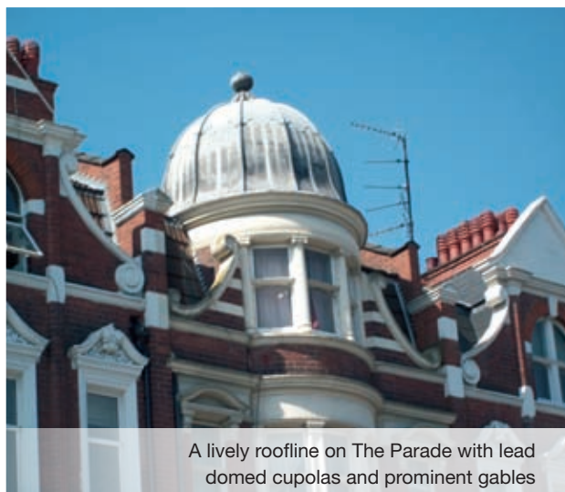
A lively roofline on The Parade with lead domed cupolas and prominent gables