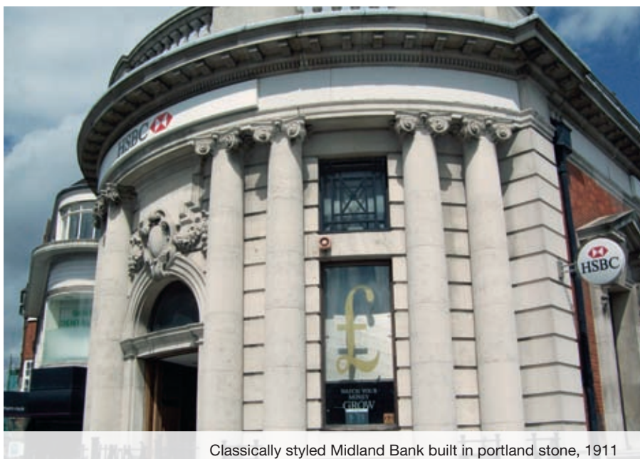
Classically styled Midland Bank built in portland stone, 1911