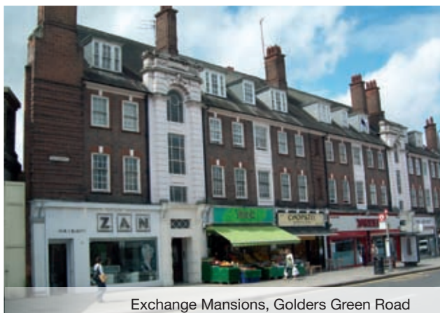
Exchange Mansions, Golders Green Road