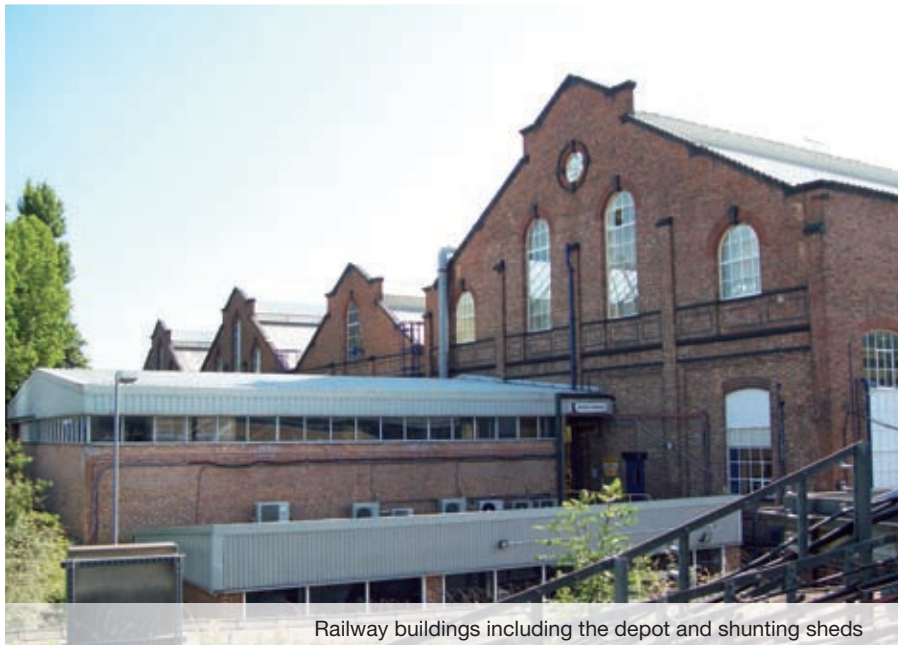
Railway buildings including the depot and shunting sheds