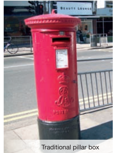
Traditional pillar box