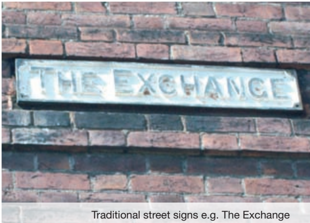
Traditional street signs e.g. The Exchange