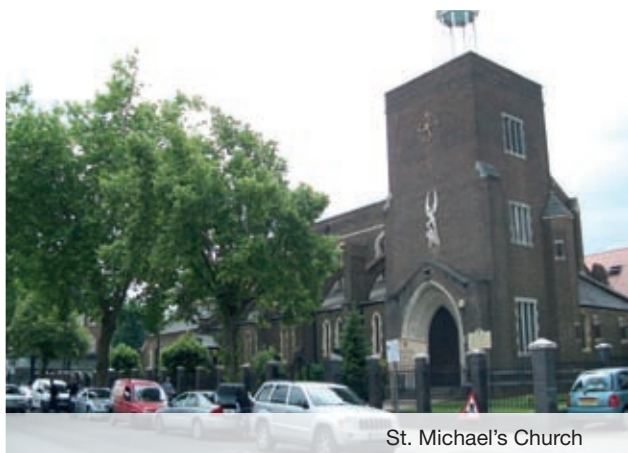
St. Michael's Church