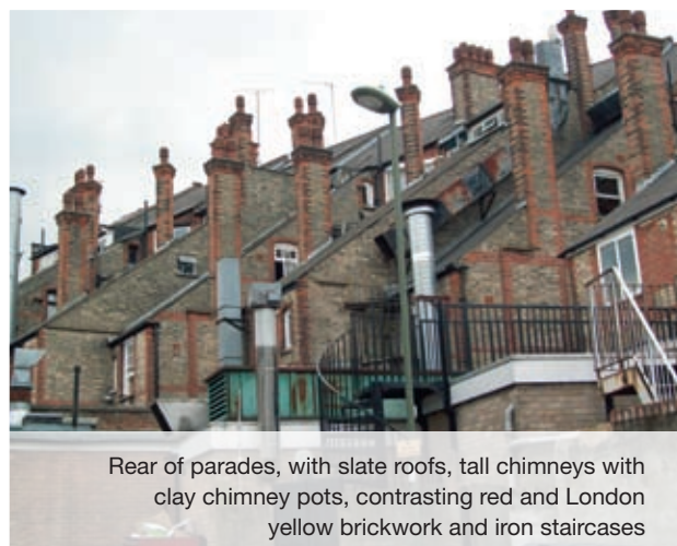
Rear of parades, with slate roofs, tall chimneys with clay chimney pots, contrasting red and London yellow brickwork and iron staircases