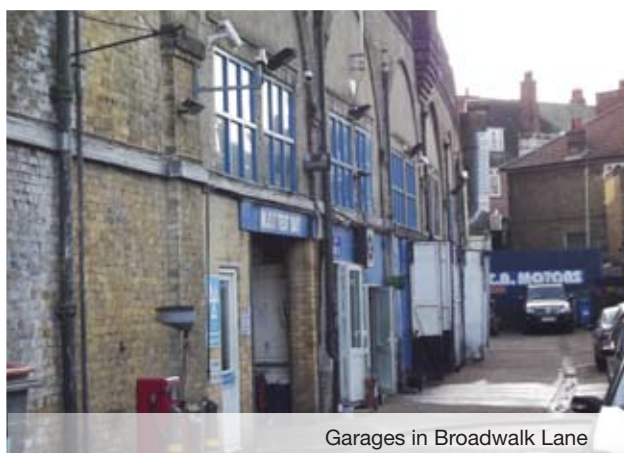
Garages in Broadwalk Lane