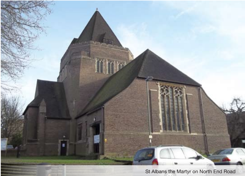
St Albans the Martyr on North End Road