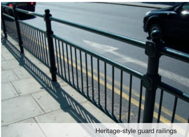
Heritage-style guard railings