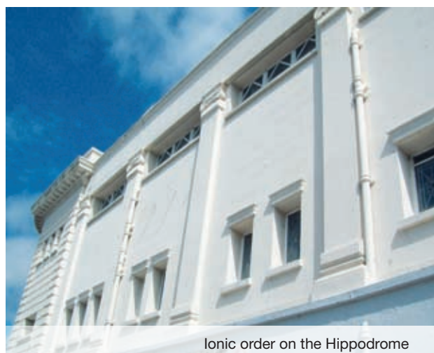
Ionic order on the Hippodrome