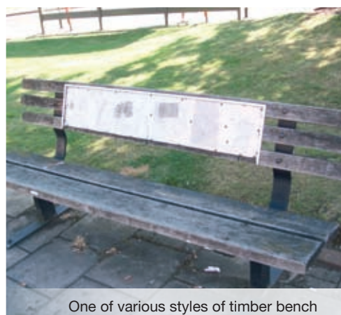
One of various styles of timber bench