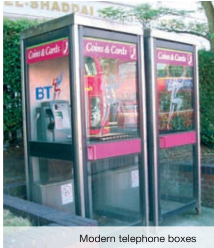
Modern telephone boxes