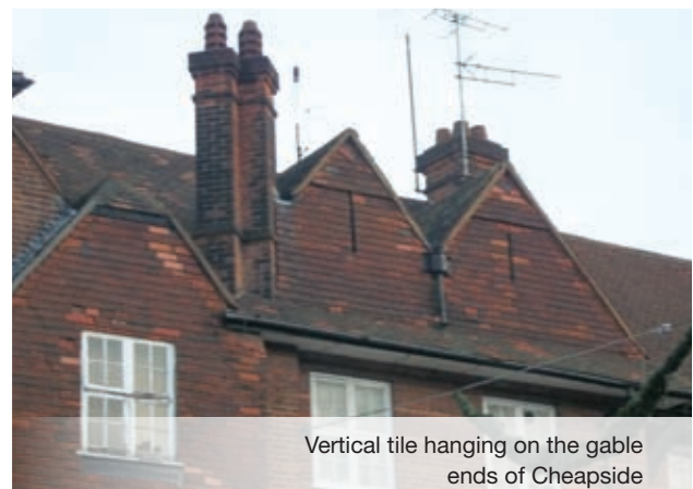
Vertical tile hanging on the gable ends of Cheapside

Locally manufactured clay tiles, feature on the upper floors of some buildings particularly gable ends e.g. Cheapside.