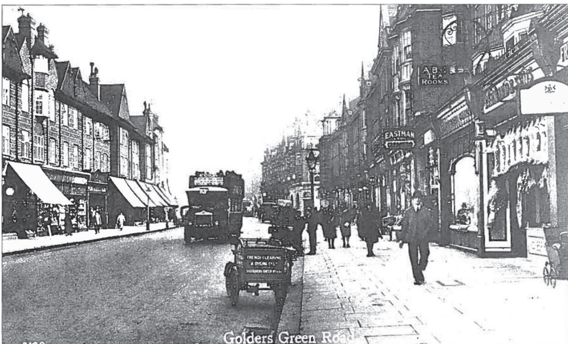
Golders Green Road, 1920s. The box tricycle in the foreground was a popular method for delivering goods of every description. It was also famously used by Walls' Ice-cream whose slogan was 'Stop Me and Buy One'. The butcher's shop on the right, with its open frontage displaying carcasses of meat, was a typical feature of those days. Fishmongers used similar shops.