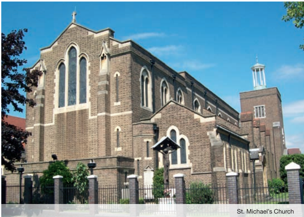
St. Michael's Church

The railway interchange and bus / coach station dominates the junction of Finchley Road with Golders Green Road and North End Road. The area is very busy and noisy with buses, coaches and associated passenger traffic, particularly at peak times, when conflict can arise between traffic and pedestrian needs.