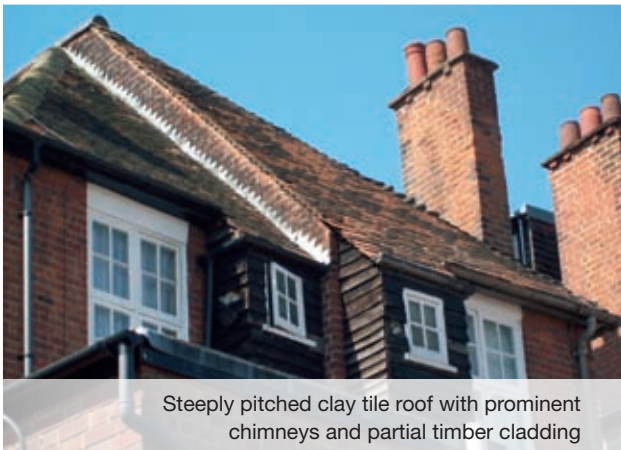
Steeply pitched clay tile roof with prominent chimneys and partial timber cladding