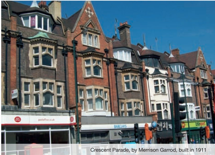
Crescent Parade, by Merrison Garrod, built in 1911