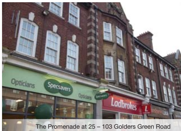
The Promenade at 25 – 103 Golders Green Road