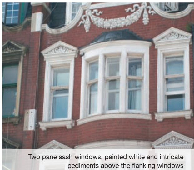
Two pane sash windows, painted white and intricate pediments above the flanking windows

The predominant window types in the Conservation Area are traditionally detailed timber vertically sliding sashes and casements. Casements and sashes can be seen with a mixture of glazing divisions, from a simple two panes through to six or eight panes. In respect of the sashes, there is often a purposeful mixture of pane sizes within one building, together with a mixture within a single window e.g. the upper sash with multiple divisions, the lower sash with just two. Window openings are commonly recessed. Most windows are painted white although a significant number are darker e.g. Finchley Road 867 – 893. Some casements have decorative leaded lights.