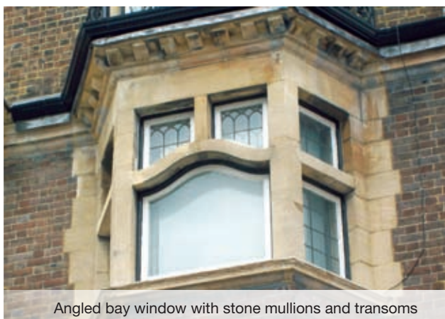
Angled bay window with stone mullions and transoms