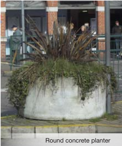
Round concrete planter