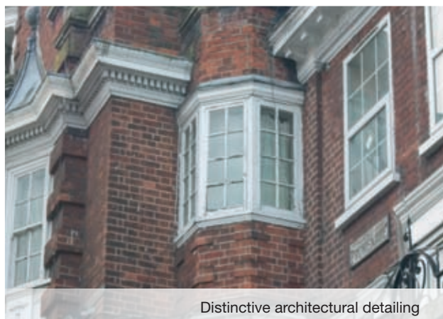
Distinctive architectural detailing