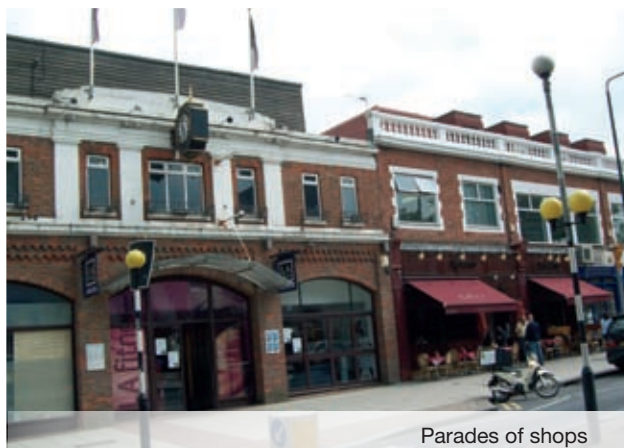
Parades of shops