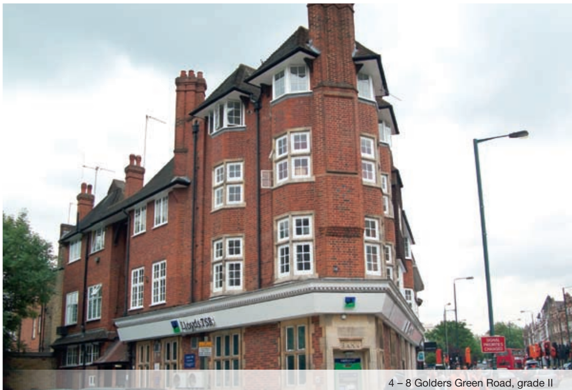
4 – 8 Golders Green Road, grade II