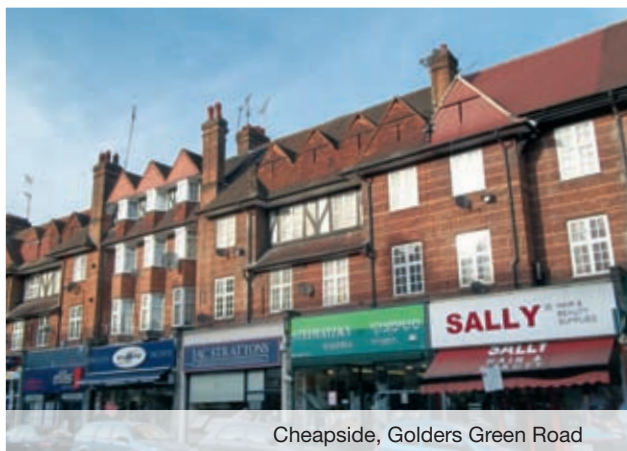
Cheapside, Golders Green Road