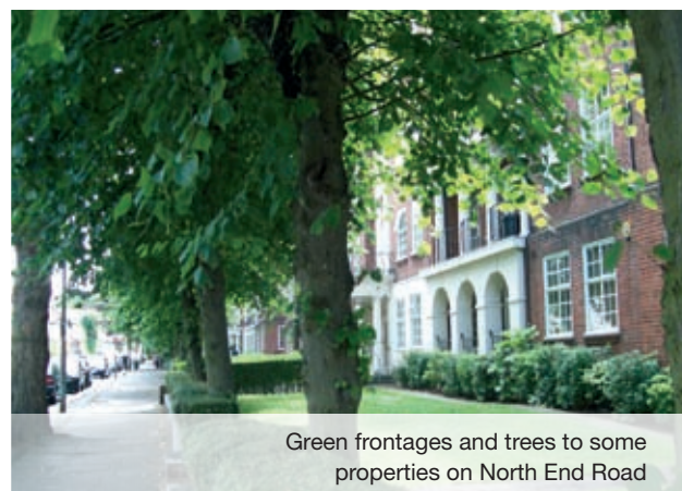
Green frontages and trees to some properties on North End Road

Several of the trees in the Conservation Area are included in Tree Preservation Orders (e.g. along North End Road and West Heath Avenue) and formal council consent is required for their treatment. The other trees in the Conservation Area are protected more generally. In accordance with the legislation,