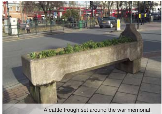
A cattle trough set around the war memorial