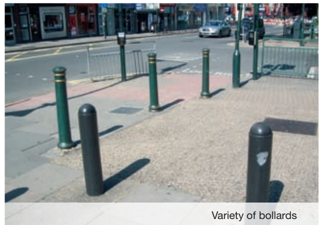
Variety of bollards