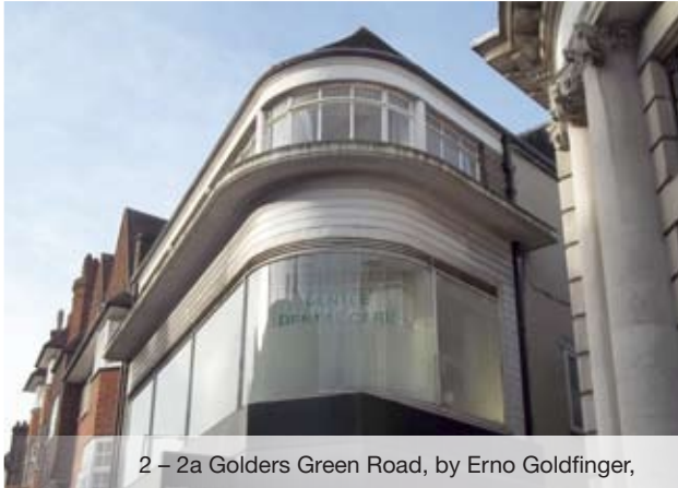
2 – 2a Golders Green Road, by Erno Goldfinger,